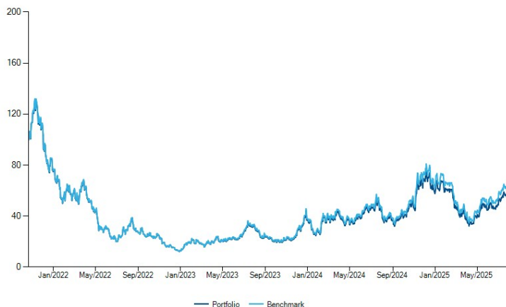
Performance Evolution (NAV)